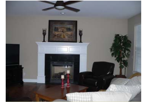
To a stylish living room.