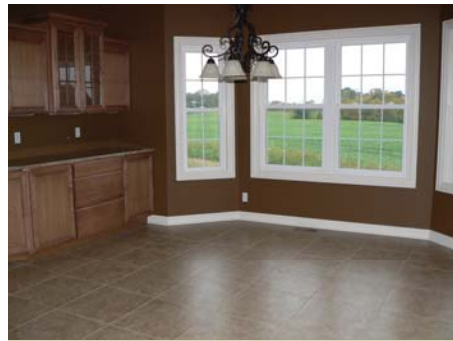
A spacious kitchen...