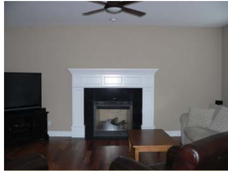
A simple living room...