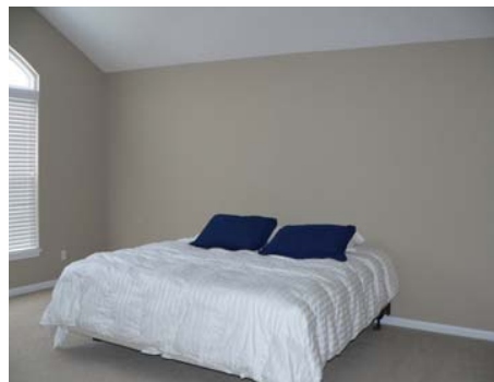
A functional master bedroom...