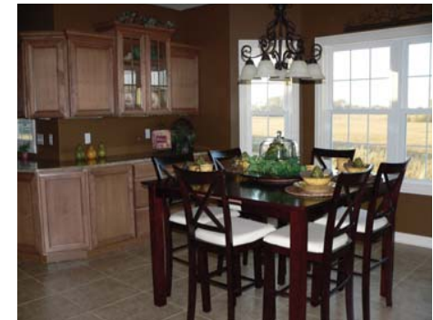
To a gorgeous eat-in kitchen.