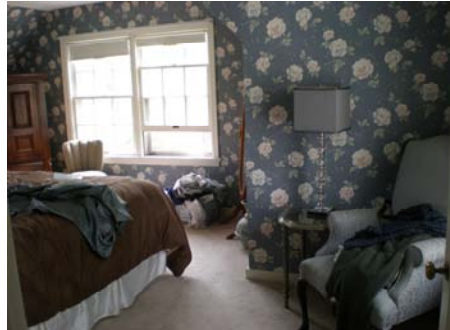
Messy and wallpapered...