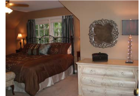
To a restful haven.