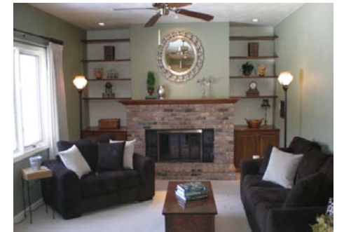
To "Welcome Home".