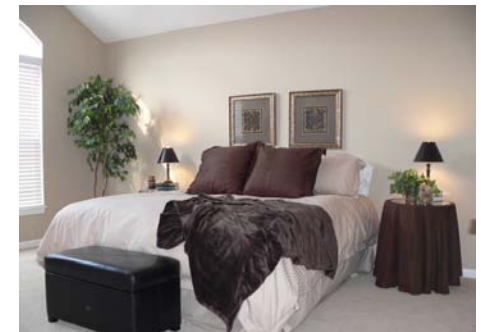
To a sophisticated master suite.